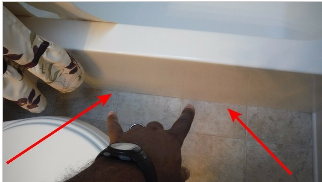
Upstairs bathroom surrounds

Unsealed areas at bath surrounds in the master and upstairs bathrooms. This is a water penetration/substrate damage concern. Recommend repairs by qualified person.