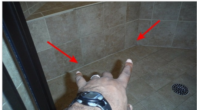
Master bathroom shower surrounds

Observed loose shower stems in the upstairs and downstairs hallway bathrooms. This is a movement concern. Recommend repairs by a qualified person.