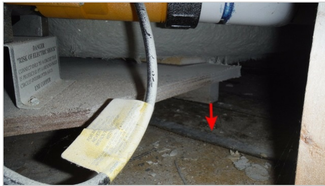
Jetted tub-master bathroom