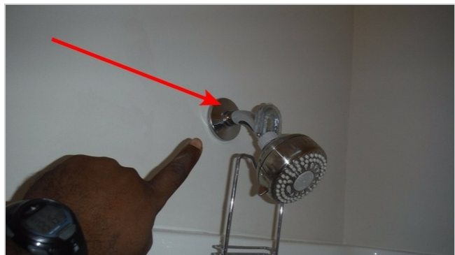
Upstairs bathroom shower stem

The jetted tub was tested by filling the tub above the jets and engaging the on/off switch. The operation of the tub was done by verifying that water was coming out of each of the jets. Tool less panels are removed when possible to inspect underneath tub. Panels requiring tools were not removed during inspection. There were concerns observed with the jetted tub.