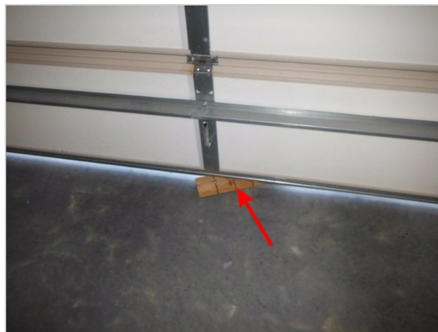
Did not reverse

The rear most garage door did not reverse when met with reasonable resistance (as tested with a 2x4 block). This is a safety concern. Recommend repairs/adjustments by qualified person and verifying proper operation prior to closing.