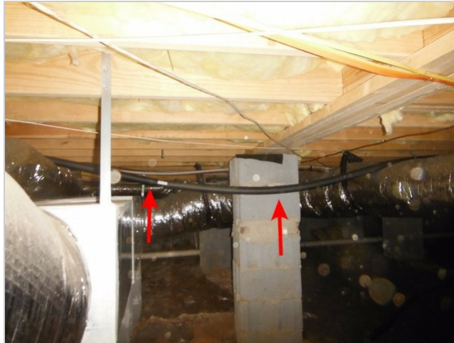
Water line not fully supported

Water lines in areas at but not limited to the center of the crawlspace are not fully supported. This is a movement/damage concern. Recommend repairs by qualified person.