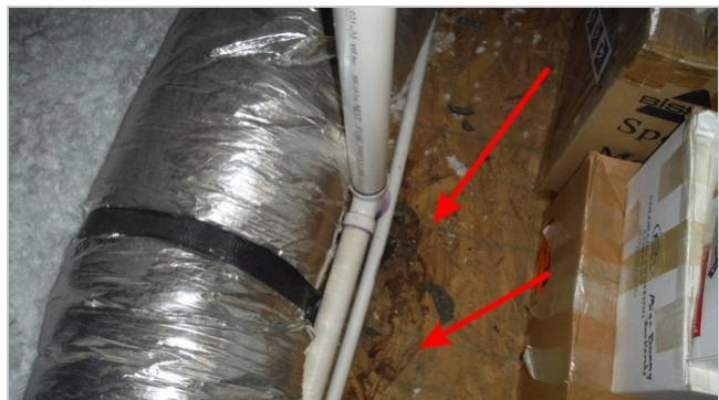
Deck staining below exhaust vent-attic

LVL framing at the front right of house is not fully bearing at the heel cut. This is a