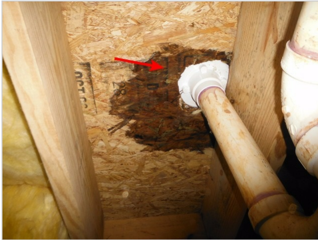
Staining/elevated moisture-Stall shower