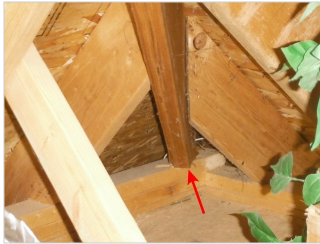
Not fully bearing

support/installation/damage concern. Recommend repairs as directed by qualified contractor.