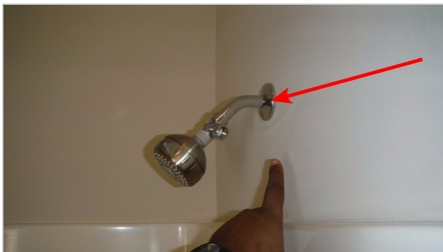
Downstairs hallway bathroom shower stem

Observed loose shower stems in the upstairs and downstairs hallway bathrooms. This is a movement concern. Recommend repairs by a qualified person.