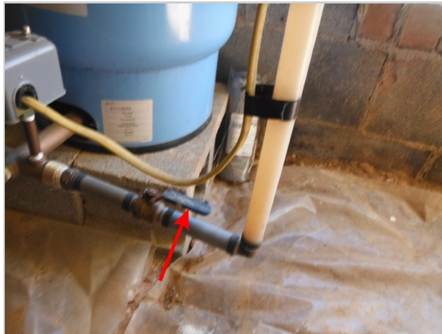
Water shut off-Crawlspace

The main water shutoff valve for the home was located in the crawlspace. Water shutoff valves are visually inspected only. No attempt is made to operate the main or any other water supply shutoff valves during the inspection. These valves are infrequently used and could leak after being operated. This is for your information.