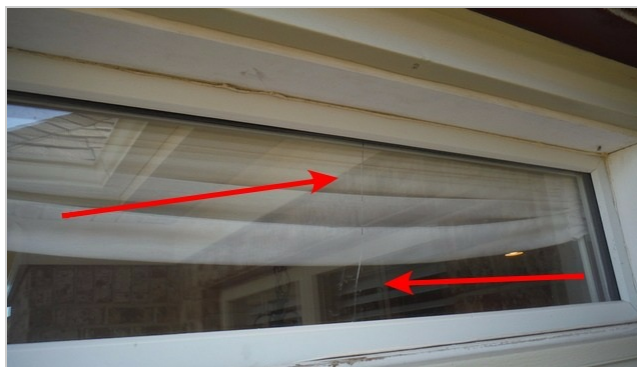
Cracked window pane-rear entry door

Window pane above rear entry door of the home was cracked at the time of the inspection. This is a damage concern. Recommend repairs by a qualified contractor.