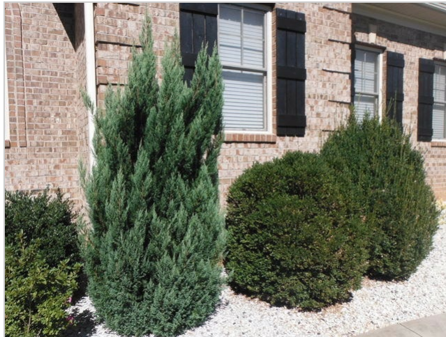
Vegetation at house-Front

Vegetation touching front side of the house. It is recommended to have an 18-24 inch clearance between vegetation and siding to minimize moisture/pest concerns. Recommend repairs by qualified person.