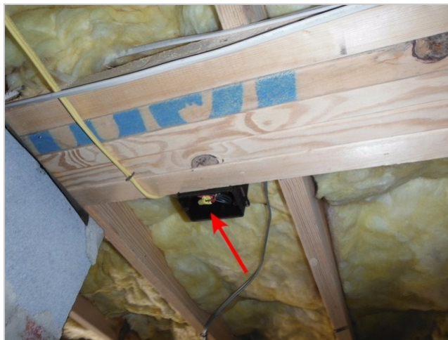
Open junction box-Crawlspace

Open junction box observed at but not limited to the rear left of crawlspace. This is a damage/shock concern. Recommend repairs by a qualified person.