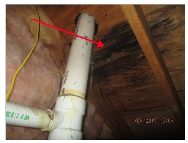
Close up of damage