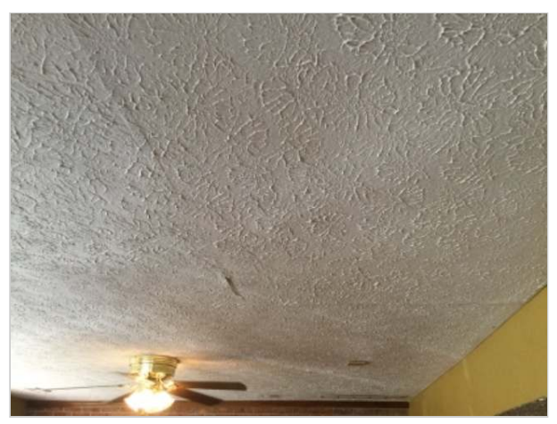
Past patching/repairs were visible at the garage ceiling at the rear left.