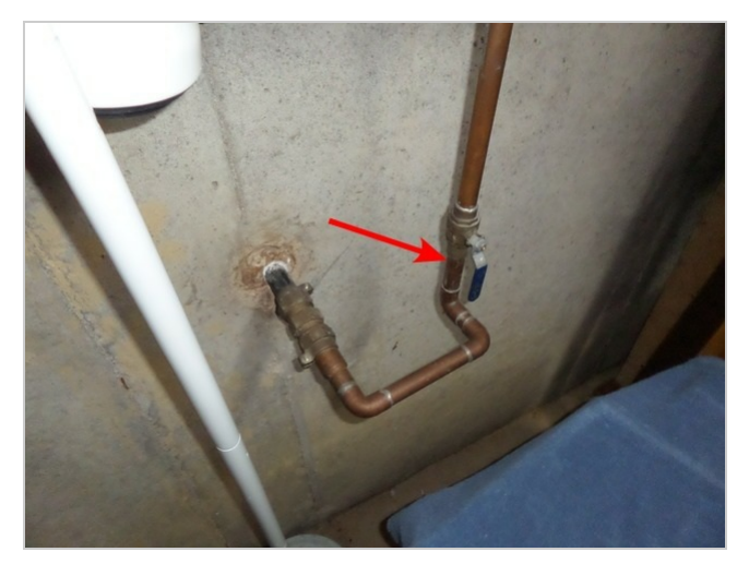
main water shut off

The water meter was located in the front yard. The main water shutoff valve for the home was located adjacent to the water service entry point in the basement.