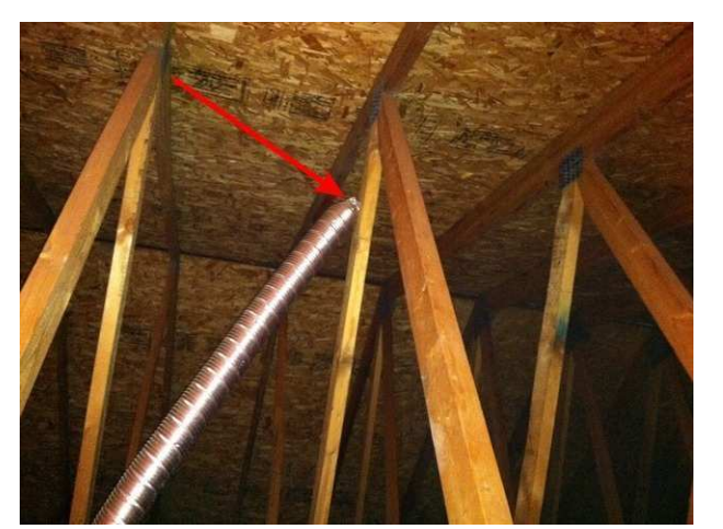
extend to roof vent

The two bathroom exhaust fans are discharging into the attic. Excessive moisture can build up in the insulation, creating a condition for mold growth. A duct should be installed from the fan exhaust to a roof vent.