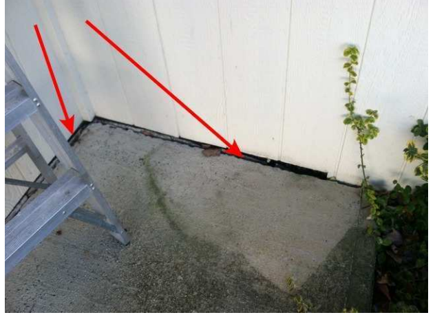
seal to prevent water intrusion

There was a patio of cement pavers located in the back of the home. There were some visual defects observed to the patio.