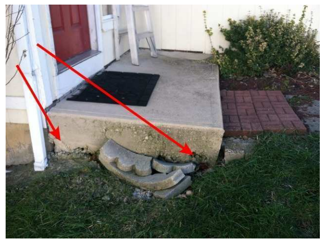
fill in to where arrows are pointed to slope away from foundation

The left side of the front entryway has sunken slightly. Grading should be added to help prevent water intrusion to this area. Add sand /soil to fill in near the foundation and porch as needed.