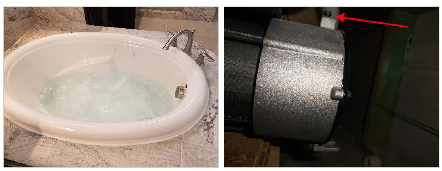
view of spa tub.