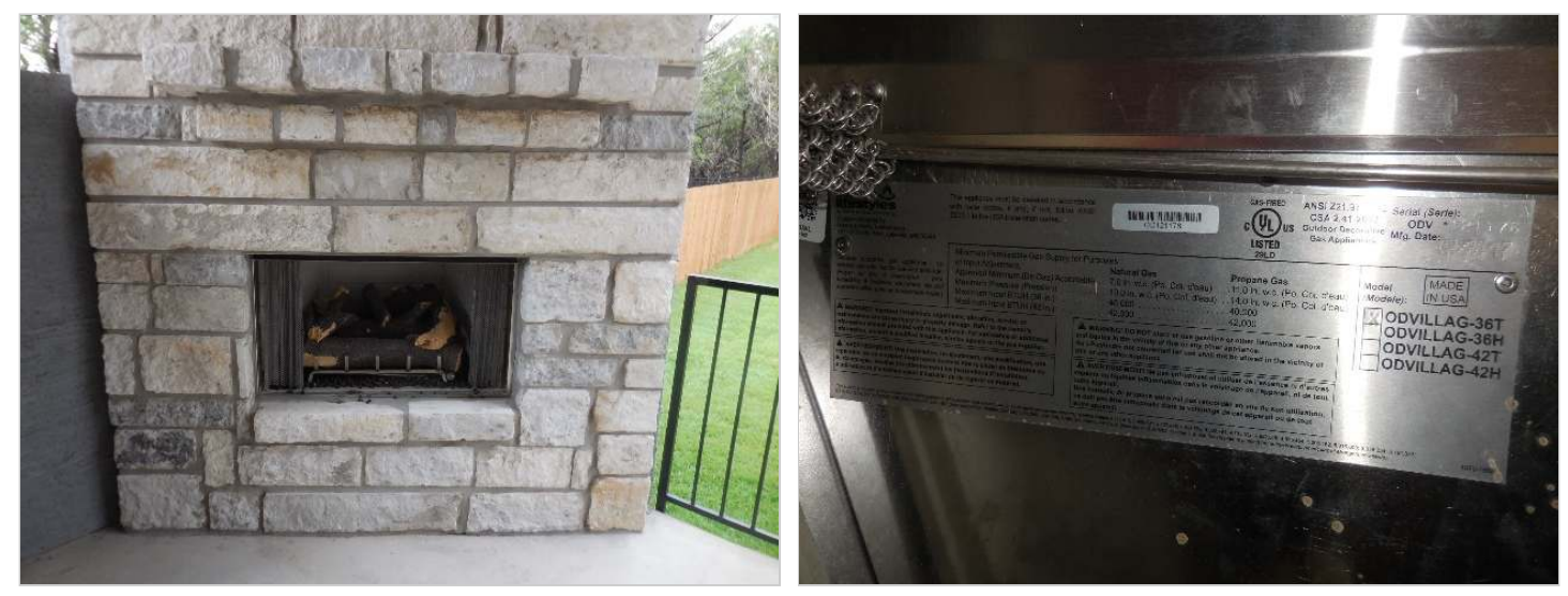
View of patio fireplace.

(none) There were no significant visible deficiencies to the fireplace or chimney were observed at the time of the inspection.