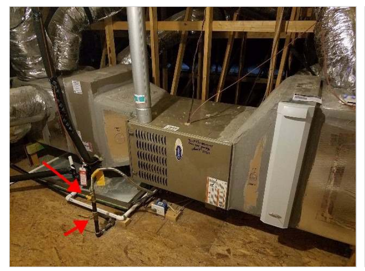
view of lower HVAC unit: gas and heater system off.

Note: The sizing, efficiency or adequacy of a system is not within the scope of the inspection. When gas furnaces are present, a full evaluation of the integrity of a heat exchanger requires dismantling of the furnace and is beyond the scope of a visual inspection. Gas heating units should be serviced on a regular basis.