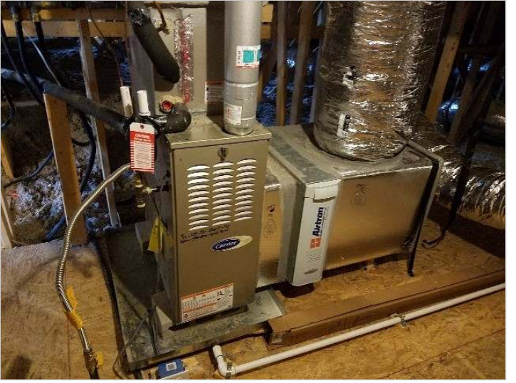
view of upper HVAC unit.