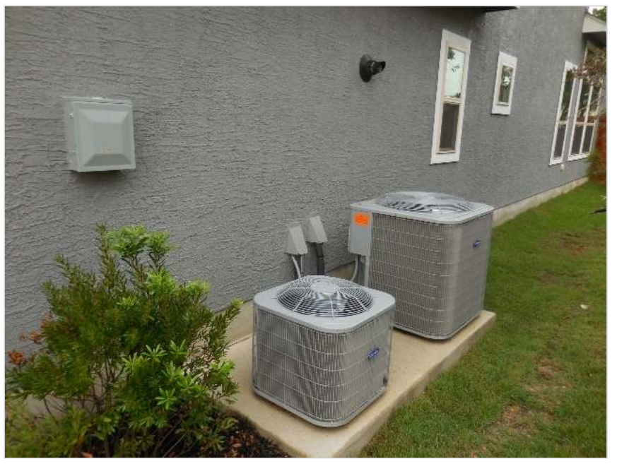
View of condenser units.

Maintenance Tips: A/C filters should be routinely changed or cleaned for efficient operation. The area around the condensing unit should be kept clean. To prevent condensate drain clogging, have your system serviced regularly and pour ½-cup of bleach or white distilled vinegar in the pour spout three times during the warm season when the air conditioner is working. It will kill algae and bacteria. Do not pour bleach in the pour spout in cold weather when the heat is working. The bleach needs to mix with condensate otherwise it will gradually eat away at the PVC. It is recommended that you use the vinegar every three months.