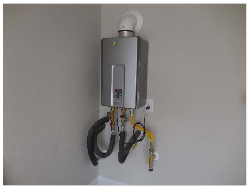
View of tankless water heater in garage.

(none) There were no visible deficiencies noted on the water heater(s) at the time of inspection.