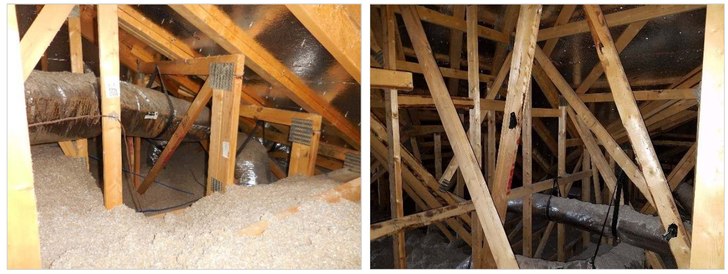
View of upper attic space (over common room).

(none) No major visual deficiencies were observed on the roof structures and attics at the time of the inspection.