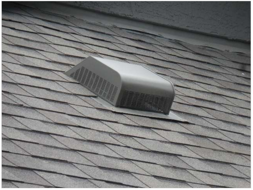
Screened dryer vent cover.

The dryer vent has a screened or grated termination cover which collects lint and is a potential fire hazard. Recommend removing and replacing with an appropriate dryer cover with back-draft damper