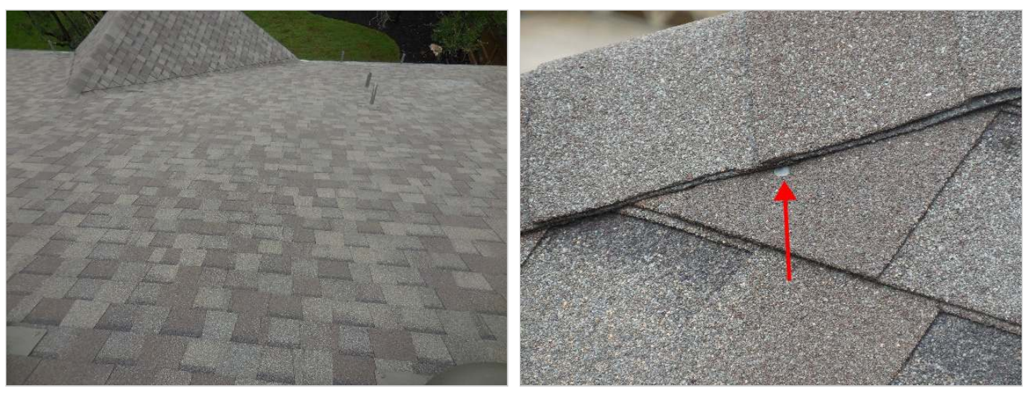
View of roof covering (back).