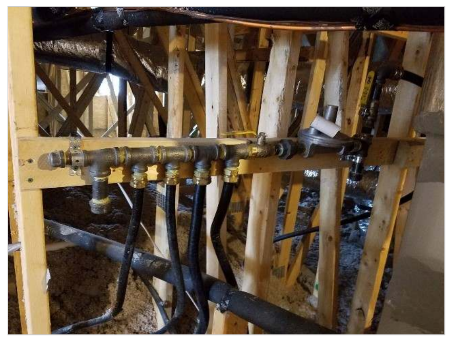
CSST manifold in attic space.

Corrugated Stainless Steel Tubing (CSST) was used in the gas supply system and we were unable to verify proper adherence to the manufacturer's bonding instructions. Bonding to the gas supply system was observed at the gas supply line next to the gas meter. (New Homes with CSST) It is recommended that you consult with your builder and have them certify proper CSST bonding according to the specific manufacturers instructions. CSST Advisory Notes: The lack of suitable electrical bonding may increase the potential for lightning strikes to cause arching at the CSST gas piping and may result in perforation of the piping, gas leaks, and fires. Proper adherence to the manufacturer's bonding instructions should lower the risk of electrical arcing and related damage. It is recommended that you retain a licensed electrician (or certified CSST specialist) for further evaluation of the installation and that corrective action be taken as needed. Deficiencies: