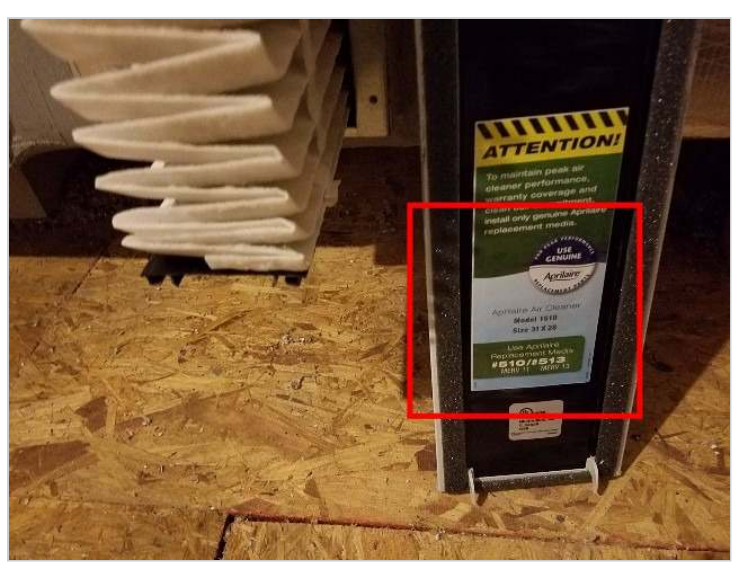
lower HVAC unit filter media type/size.

media filter installed backwards -- metal screen not facing suction side (upper HVAC unit).