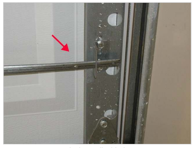
lock not disabled

The unit was functioning properly at the time of the inspection. However, the manual door lock had not been disabled.