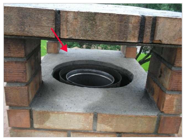
missing inner cap