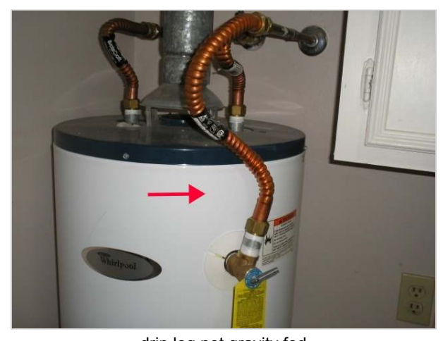
drip leg not gravity fed Page 11 of 16

The 2016 Whirlpool water heater located in the utility room was functioning properly at the time of the inspection. The relief valve drip-leg was not gravity fed.