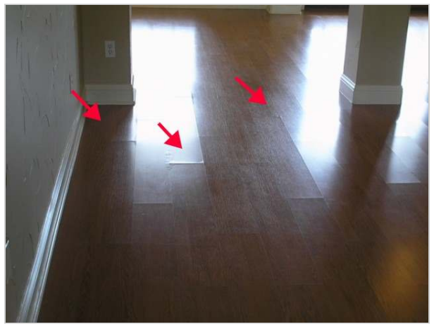
floor covering warped