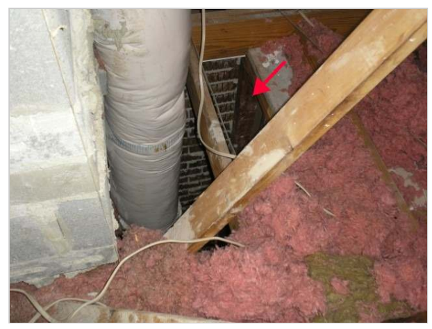
missing fire blocking