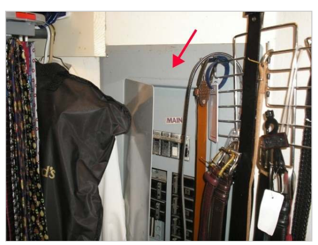
panel box in hazardous location

The overhead electrical service entered a panel box located in the master bedroom clothes closet. Clothes closets are considered to be a hazardous location.