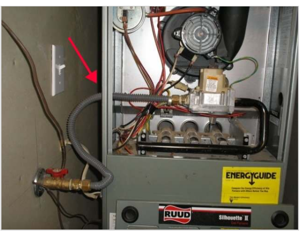
gas line / housing

Note: The sizing, efficiency or adequacy of a system is not within the scope of the inspection. When gas furnaces are present, a full evaluation of the integrity of a heat exchanger requires dismantling of the furnace and is beyond the scope of a visual inspection.