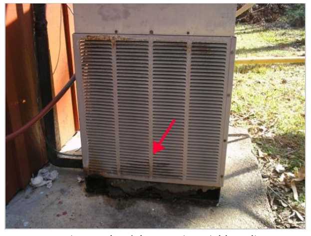
rust corrosion / damage to outside unit

Note: The sizing, efficiency or adequacy of a system is not within the scope of the inspection.