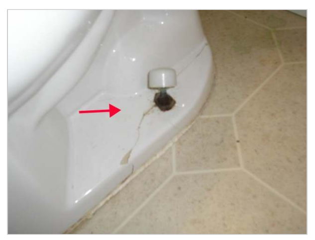
commode base cracked

Water was run into the sink(s) and tub(s) for approximately one hour. The hall bathroom commode was cracked at the base. It is recommended that a plumber be contacted.