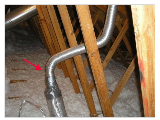
improper dryer vent pipe