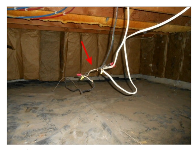
Open spliced wiring in the crawlspace.

There were a few open splices noted throughout the crawlspace at the time of inspection. Open splices consist of wires joined together outside of a junction box or loose wiring. This is a safety concern which should be corrected by a qualified electrician prior to closing.