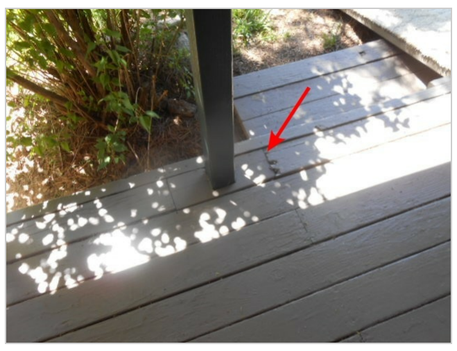
Loose or deteriorated deck boards on the rear deck.