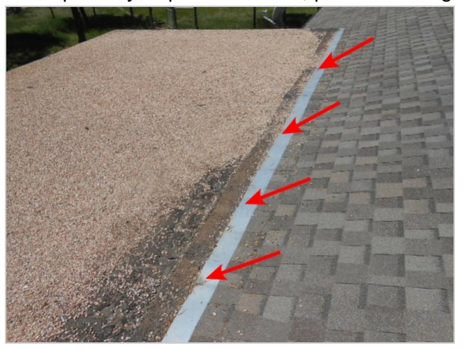
This transition roof flashing is loose or is not secured which can lead to roof leakage if not repaired.

The transition roof flashing (where the house roof meets the patio roof) is loose or is unsecured indicating the need for further evaluation and repairs by a qualified roofer, prior to closing.