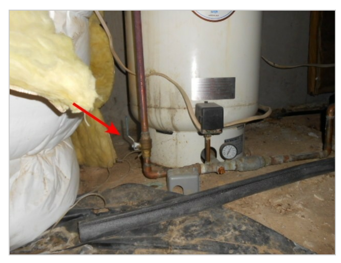
This is the main water shut off valve for the home.

The main water shutoff valve for the home was also located in the crawlspace.