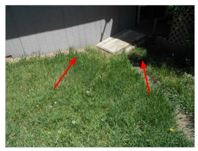
This area of exterior grading on the rear of the home is sloping towards the home.

Some of the exterior siding on the rear of the home is in contact or is under the ground or earth. This condition can lead to wood rot or insect intrusion if not corrected. Further evaluation is recommended by a qualified contractor, prior to closing.