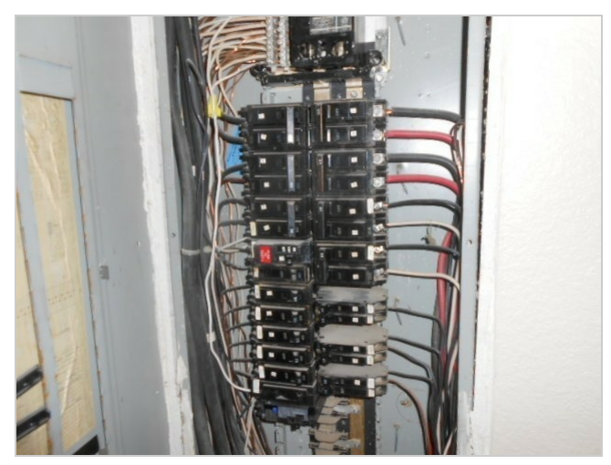
The electrical panel cover was removed for inspection of the house wiring, circuits and breakers.

The branch circuits within the panel were constructed of copper wiring. These branch circuits and the circuit breaker to which they were attached appeared to be appropriately matched. The visible house wiring consisted primarily of the Romex type and appeared to be in overall good condition.