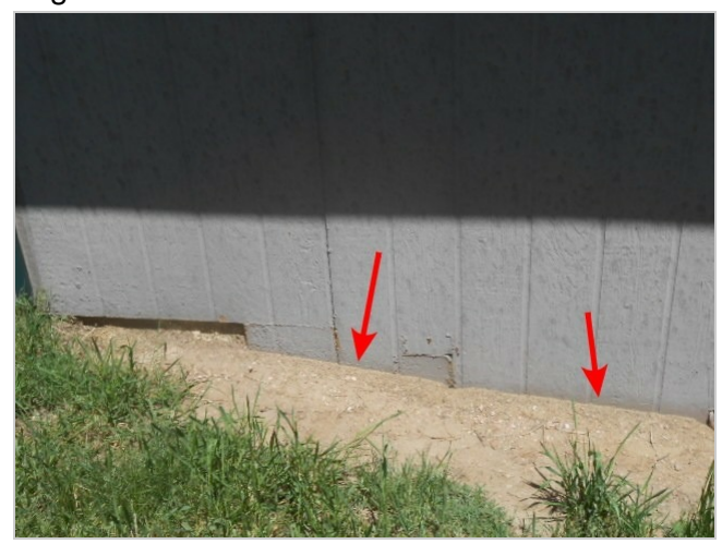
This section of siding on the rear of the home is in contact with the ground or earth.

Some of the exterior siding on the rear of the home is in contact or is under the ground or earth. This condition can lead to wood rot or insect intrusion if not corrected. Further evaluation is recommended by a qualified contractor, prior to closing.