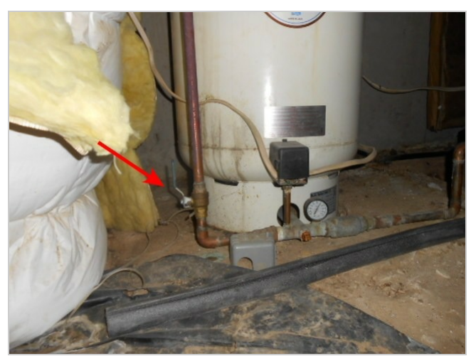
This is the main water shut off valve for the home.

The main water shutoff valve for the home was also located in the crawlspace.