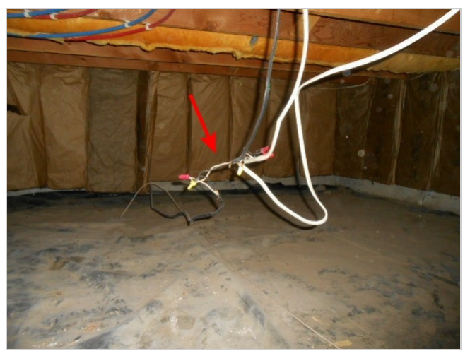
Open spliced wiring in the crawlspace.

There were a few open splices noted throughout the crawlspace at the time of inspection. Open splices consist of wires joined together outside of a junction box or loose wiring. This is a safety concern which should be corrected by a qualified electrician prior to closing.