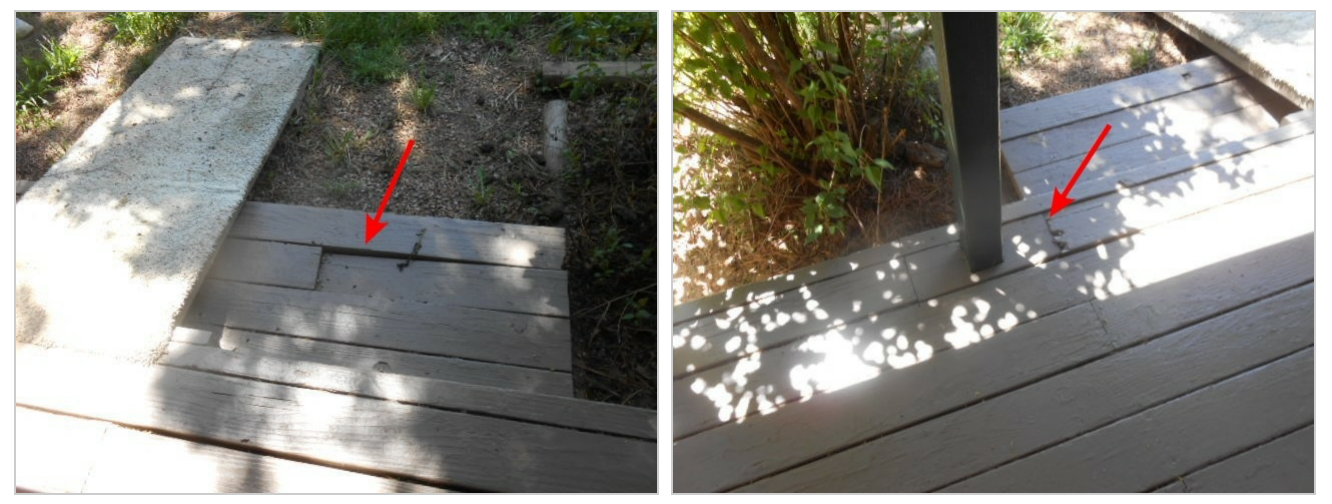
Loose or deteriorated deck board on the rear deck.