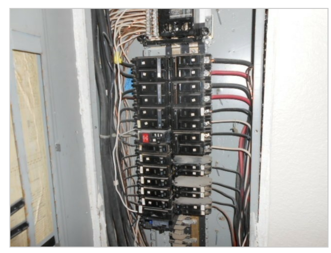
The electrical panel cover was removed for inspection of the house wiring, circuits and breakers.

The branch circuits within the panel were constructed of copper wiring. These branch circuits and the circuit breaker to which they were attached appeared to be appropriately matched. The visible house wiring consisted primarily of the Romex type and appeared to be in overall good condition.