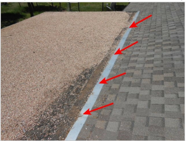
This transition roof flashing is loose or is not secured which can lead to roof leakage if not repaired.

The transition roof flashing (where the house roof meets the patio roof) is loose or is unsecured indicating the need for further evaluation and repairs by a qualified roofer, prior to closing.