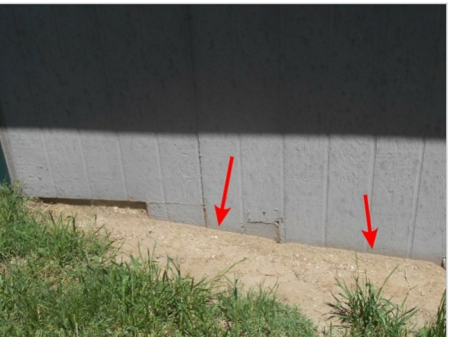
This section of siding on the rear of the home is in contact with the ground or earth.

Some of the exterior siding on the rear of the home is in contact or is under the ground or earth. This condition can lead to wood rot or insect intrusion if not corrected. Further evaluation is recommended by a qualified contractor, prior to closing.